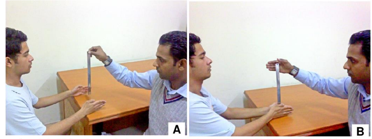
lustration of the Nelson's speed of movement test: A - Starting position: B - End position

Nelson's Speed of Movement Test (Singh et al., 2009)